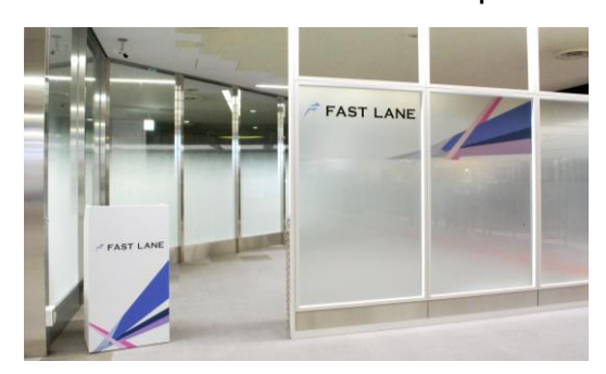
[Terminal 1 Fast Lane]

As the number of foreign visitors to Japan grows rapidly towards 2020, Narita Airport will make arrival procedures as rapid and stress-free as possible, in order to continue serving as one of the most comfortable airports in the world.