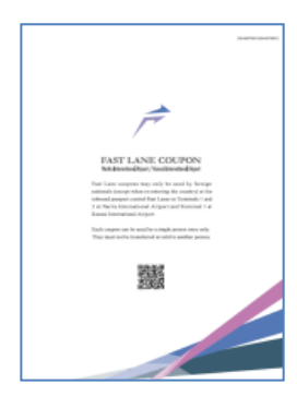
[Fast Lane Coupon (Face)]