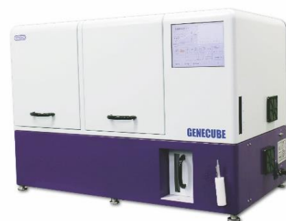
"GENECUBE" fully-automated gene analysis system