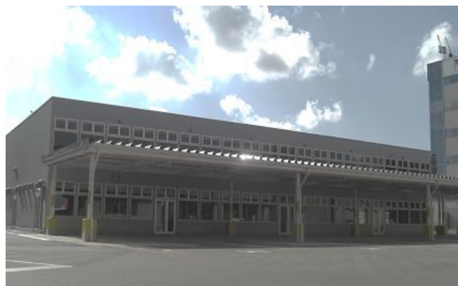
Photo: Departure bus-gate lounge