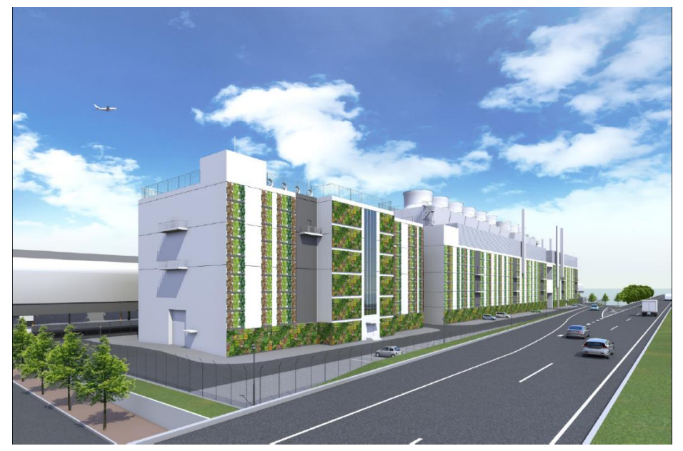
Illustration of New Central Heating and Cooling Plant

introduction of a cutting-edge energy management systems as well as advanced technology in the form of digital innovation in security, etc.