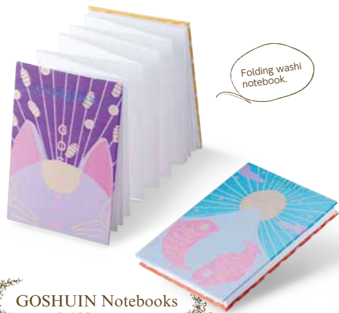
Folding washi notebook.