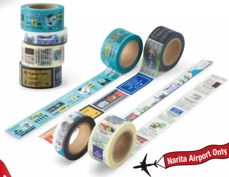
Narita Airport Only

Terminal 2 Wamonoya Kaya Terminal 2, Main Building, 4F Hours: 7:30-21:00 Tel. 0476-34-6787 * There is also a store in Terminal 1, Central Building, 4F.