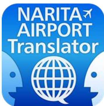
Icon of application