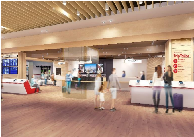
Illustration of the completed facility (Central counter (new))

The concept behind this facility is to assist visitors with a tailor-made travel experience in Japan to suit individual preferences and objectives.