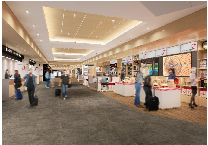
Illustration of the completed facility (Mobile phone rental counters and promotion corner)