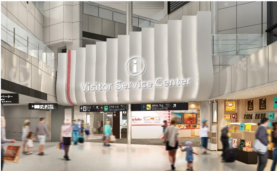
Illustration of the completed facility (view of entrance from the arrival lobby)

Narita International Airport Corporation (NAA) is delighted to announce plans for the opening of the Visitor Service Center , a new facility on the arrival level in Terminal 1 designed to improve convenience for the increasing number of visitors to Japan by providing one-stop information and services to offer a greater sense of reassurance and comfort during their stay in Japan.